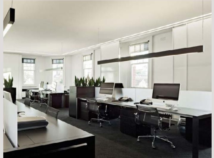
Proposed New Office

“ We love what we do, and what it takes to get there. From the initial design phases, to the day you take possession, our full-scope services not only get the job done, but get it done right.